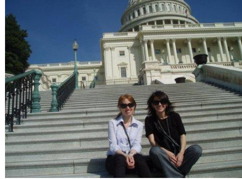
in front of